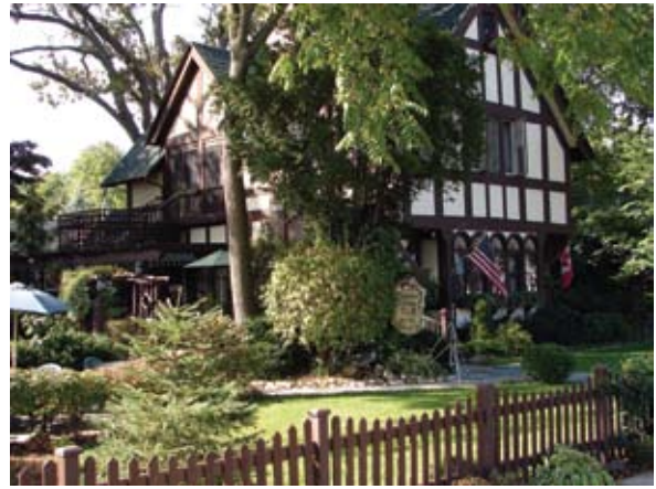
The Bishops Cottage Bed & Breakfast is a popular summer entertainment spot. It's located within the Macomb St. Business District.

If it's your desire to live in a tranquil community with abundant natural beauty, a wide range of amenities, activities for the whole family, a top-ranked schools system and suburban convenience, then you should discover Grosse Ile.