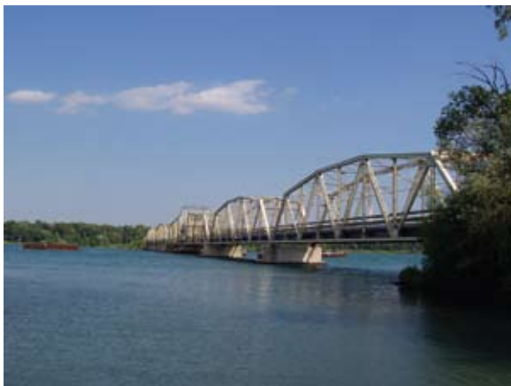
The historic Grosse Ile Bridge Toll Bridge and the Wayne County Bridge provide 24/7 access between the mainland and the island.

For most, family oriented recreation and activities are important. Certainly they are here on Grosse Ile. Islanders enjoy playing golf; boating and sailing; biking along the river; jogging or walking on tree-covered paths; playing tennis year round; supporting robust youth sports leagues; attending community festivals; or simply taking pleasure in relaxing to the sounds of local musical talent in a beautiful garden retreat.